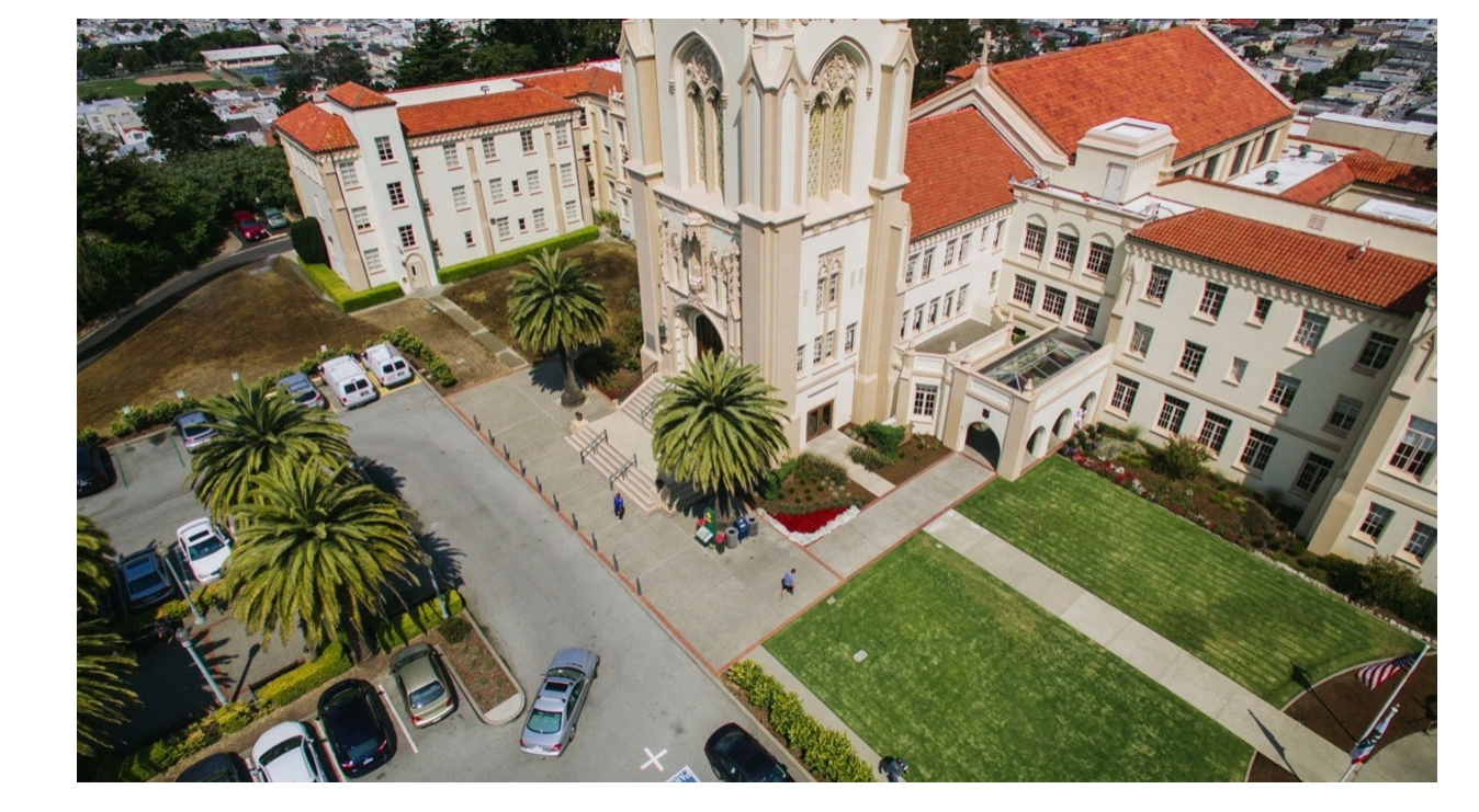
A Warm Welcome Back to the Hilltop